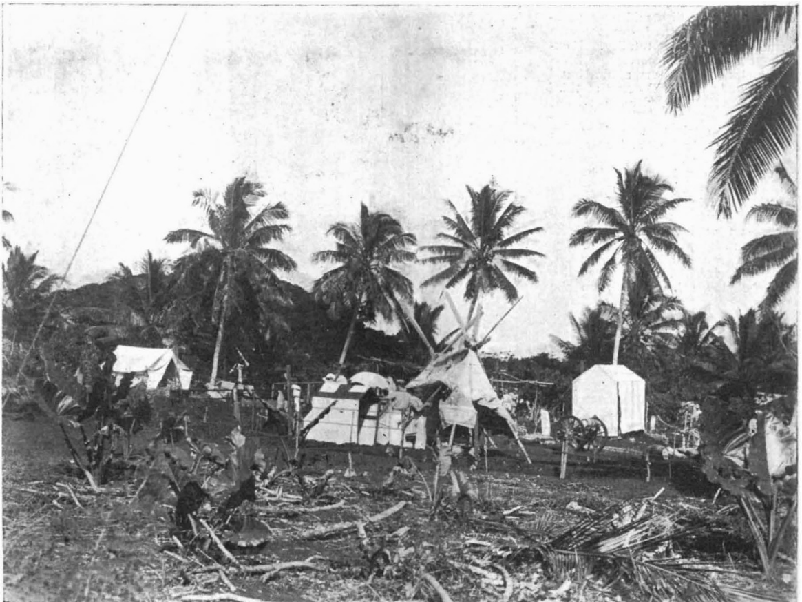
FIG. 3.—A General View of the Eclipse Camp. Camera facing nearly West.