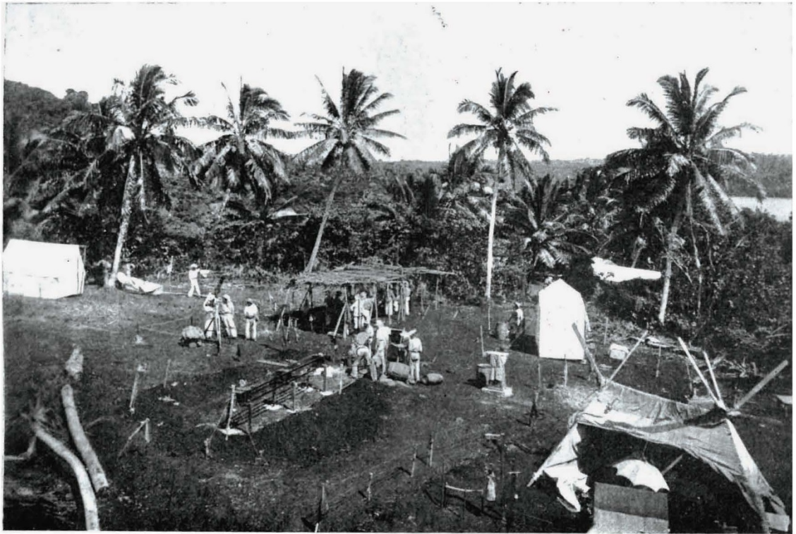
FIG. 2.—In the early stages of the erection of the Instruments. View taken from a Coconut Tree.