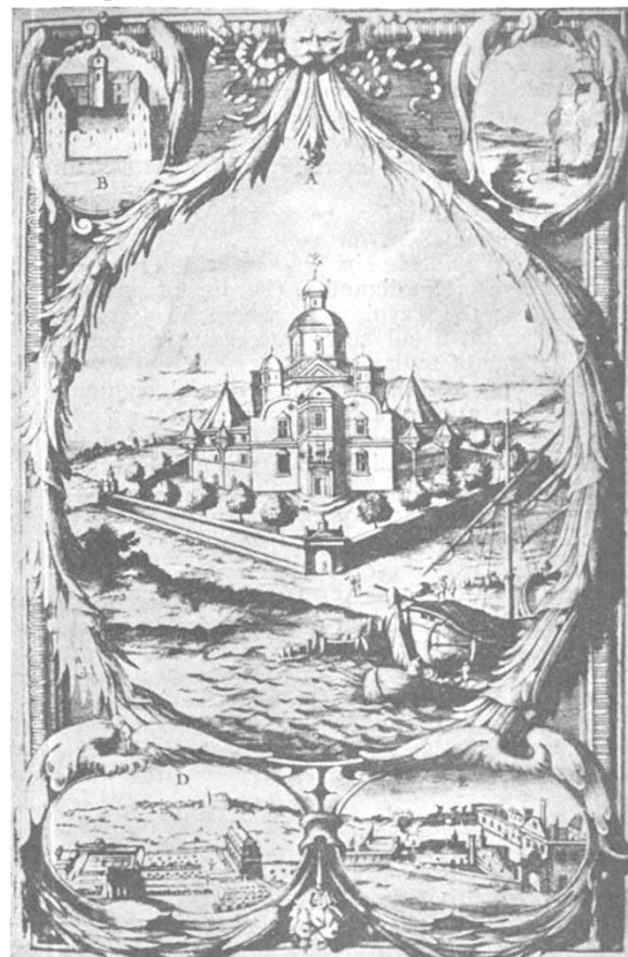
Tycho Brahe's Observatories. A, On the island Hveen (Uranienberg); B, in Wandsbeck; C, in Benetatek; D, in Prague (Ferdinandum); E, in Prague (Curtius's House).

THE Astronomical Observatory of Prague, like many other similar institutions which might be mentioned, has its work considerably restricted by the fact that the city in which it is situated has