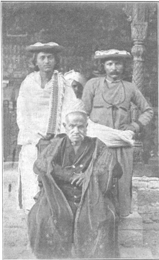
FIG. 1.—Raja of Rampur, with attendants, Punjab Hills. From "Natives of Northern India."