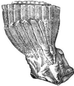
FIG. 6.— Pholidophyllum tubulatum . A calicle viewed from the side to show the rib-like prominences formed upon the costæ by the double rows of calcareous scales.

and which has lately been made a subject of research by G. von Koch, the costæ are in solitary specimens clad each with a longitudinal rib composed of a double row of rhomboidal calcareous scales placed close together at an angle to one another as shown in the figure. These rows of scales form an almost complete outer covering to the corallum. The scales seem to be wanting in colonial specimens. They are extremely conspicuous and definite in some of the best preserved solitary specimens, and their regularity of disposition is such that it is impossible to believe that they do not definitely belong to the coral. They are shown enlarged in the figure. In vertical sec-