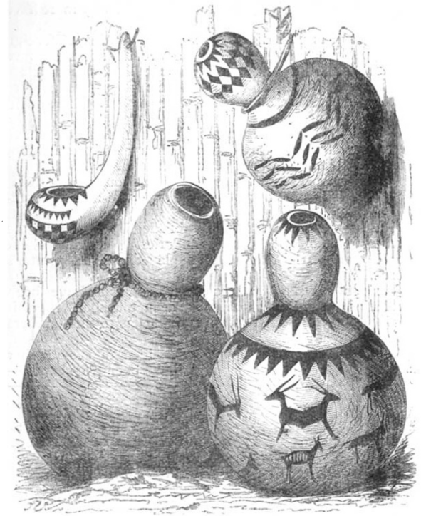
FIG. 4.—Ladle and Calabashes.

Having obtained permission from the king, the Marutze kingdom was visited. Hippopotami and crocodiles were found abundant in the rivers, but all such creatures had to be for the moment overlooked because King Sepopo was waiting to receive the white man. At the banquet fish of many sorts seems to have been the principal food;