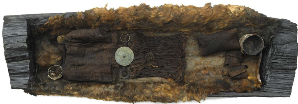
Figure 2. A photo of the remains of a Bronze Age high status female found inside an oak-coffin in a monumental burial barrow at Egtved, Denmark. The Egtved Girl's garments are extremely well preserved and her exceptional wool costume consists of several wool textile pieces as well as a disc-shaped bronze belt plate, symbolizing the sun.