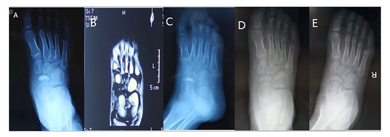
Figure 2. Case 1 radiography changes of the navicular after vascular bundle implantation. ( A ) Pre-operation X ray showed navicular bone sclerosis; ( B ) Pre-operation MRI showed ischemic status of the navicular bone; ( C ) 1 month post-operation X ray showed radiography improvement of the sclerotic navicular bone; ( D ) 3 months post-operation X ray; E, 6 months post -operation X ray.

The etiology of Kohler's disease remains unclear. As the navicular on the top of the medial arch, and under great stress among the talus and cuneiform<sup>10,12</sup>. Moreover, the ossification center of the navicular, which is the latest, may be affected by the stress and lead to the avascular necrosis of the navicular bone<sup>13,14</sup>. Drill on the