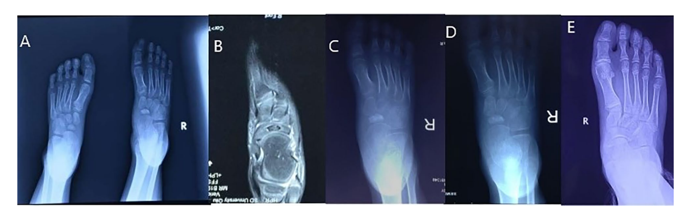
Figure 3. Case 2. ( A ) Pre-operation X ray showed the right navicular bone sclerosis, compared with the left foot; ( B ) Pre-operation MRI showed ischemic status of the navicular bone; ( C ) 1 month post-operation X ray showed radiography improvement of the sclerotic navicular bone; ( D ) 2 months post-operation X ray; ( E ) 7 years post-operation X ray.

Figure 2. Case 1 radiography changes of the navicular after vascular bundle implantation. ( A ) Pre-operation X ray showed navicular bone sclerosis; ( B ) Pre-operation MRI showed ischemic status of the navicular bone; ( C ) 1 month post-operation X ray showed radiography improvement of the sclerotic navicular bone; ( D ) 3 months post-operation X ray; E, 6 months post -operation X ray.